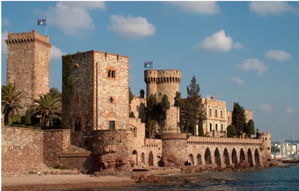
The Château de La Napoule

The Château de la Napoule is located in the historic seaside town of Mandelieu-La Napoule on the French Riviera. Situated on a spectacular site overlooking the sea, parts of the original structure date back to the 14th century. It is recognized in France as a monument historique for its incredible restoration and architectural details. Six acres of magnificent gardens surround the property. For more information, visit laf.org .