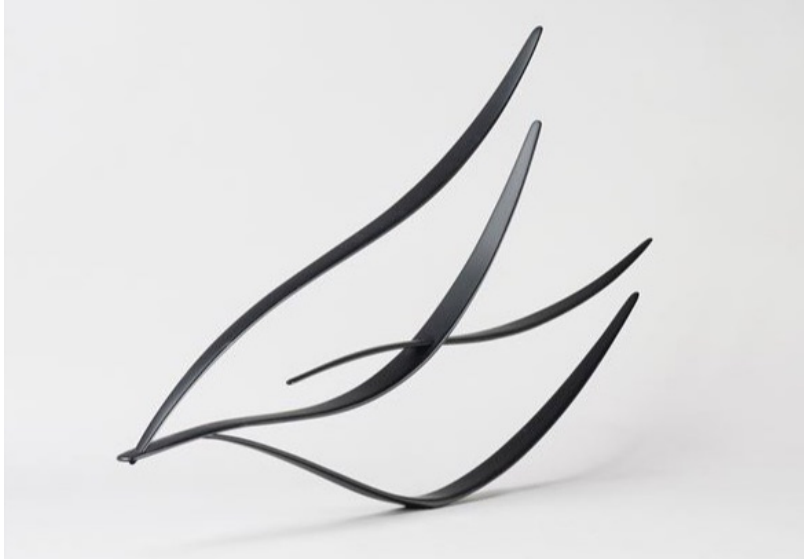
Above: Two Pairs Intersecting Each Other , carbon fiber composite and hardwood, 28 x 57 x 2 inches Right: Enclosing Form, Round , carbon fiber composite, steel, automotive paint, 84 x 42 x 7 inches